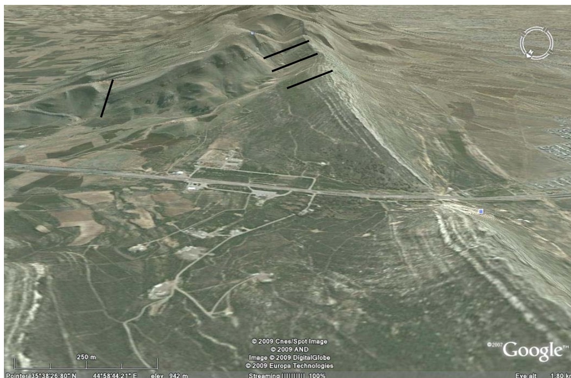
Fig.7: Google Earth image, the southeastern side of Darbandi Bazian Gorge.

— Shape and Trend of Tainal Stream: The shape and trend of the stream prove the stream was originally one stream and flowing southwestward. The Tainal Stream, in nowadays starts directly from the bottom of the Pila Spi Formation; in Darbandi Bazian Gorge (Figs.2, 6, 7 and 8). It flows northeastwards then changes its direction towards southeast and flows for about 20 Km parallel to the ridge of the Pila Spi Formation, then changes its direction to wards southwest, crosses the same ridge, in Basara Gorge (Fig.2), and flows southwards. It is clear that it was easier to Tainal Stream to cross the same ridge in Darbandi Bazian Gorge instead of Basara Gorge. It is worth mentioning that carving of the limestone beds, by Tainal Stream, of the Pila Spi Formation in Darbandi Bazian Gorge is easier than Basara Gorge, because the formation in the former is thinner and the beds are highly distorted due to faulting, which make them to be easily eroded, consequently carving will be easier. Along the straight part of Tainal Stream course, and after 11 Km from the gorge, near Tainal village (point D in Fig.2), still the divide point of the stream could be observed, where the contour line of height 850 m (a.s.l.) marks the divide point on the topographic map of Sulaimaniyah Quadrangle at scale of 1: 100000. Moreover, the branches also indicate the original direction of the stream (towards NW not SE), before changing its direction (towards SE) (Fig.2) due to Neotectonic movement.