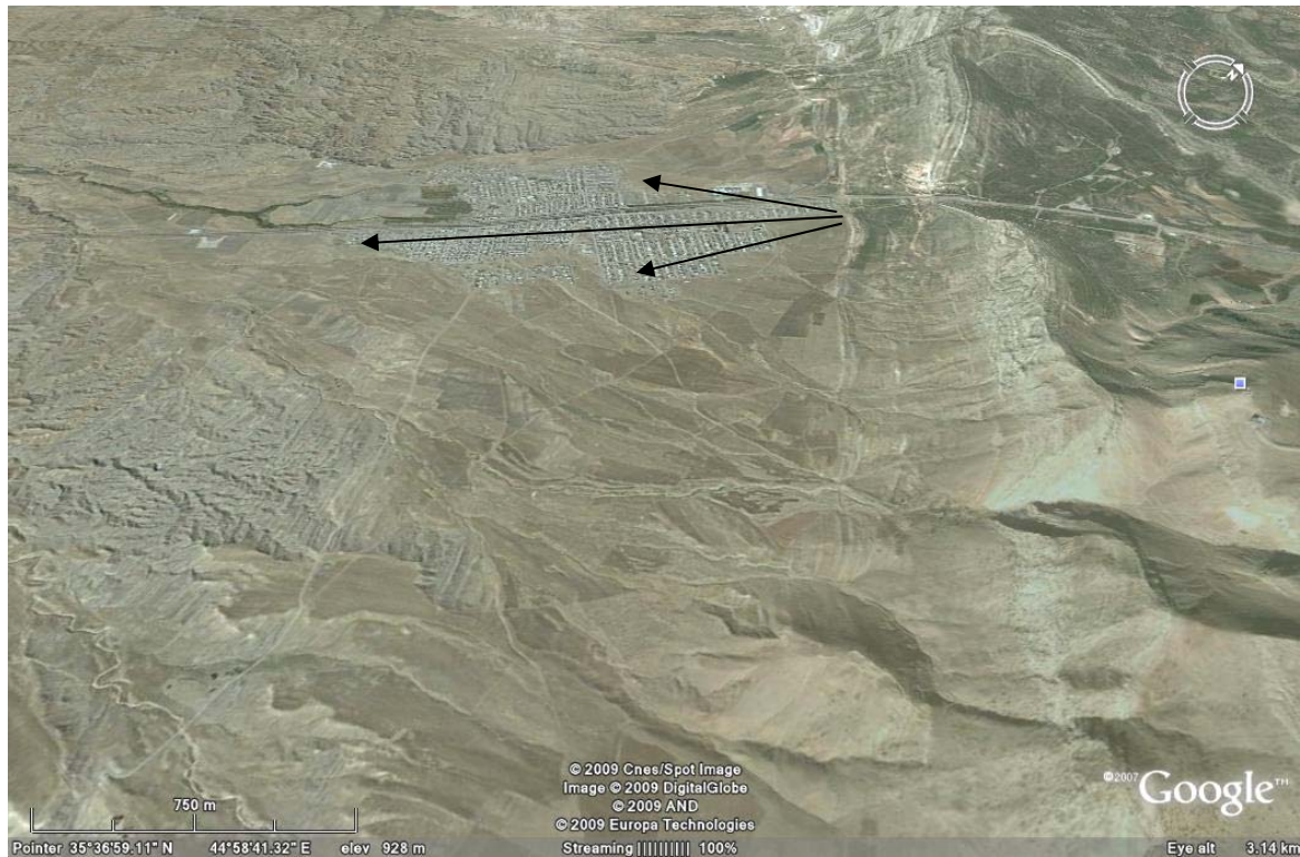
Fig.5: Google Earth image showing both sides of Darbandi Bazian Gorge. Note the size of the main fan as compared to the size of the nearby fans