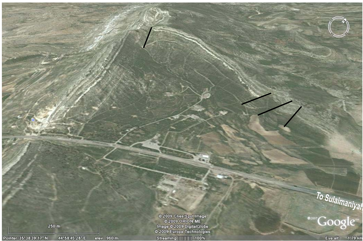
Fig.6: Google Earth image, the northwestern side of Darbandi Bazian Gorge. Note the faulted beds of the Pila Spi and Gercus formations and the absence of alluvial fans in the northeastern side