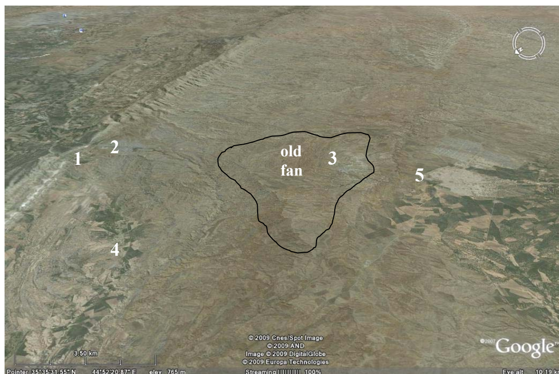
Fig.8: Google Earth image, note the location of Darbandi Bazian Gorge and starting point of Tainal Stream (1), the two alluvial fans (2 and 3), Chamai Bawa Fany Stream (4) and Cham Chamal town (5)

— Presence of Old and Large Alluvial Fan: This confirms that the stream in Darbandi Bazian Gorge was originally one stream and flowing southwestwards. The size and starting point of the present stream, before merging in Chamai Bawa Fany Stream, was disable to build such a large fan, with coverage area of about 36 \text{ Km}^2 (the remaining part only) that extends till north of Cham Chamal town (Fig.8) and to transport limestone blocks (15 – 40 cm) to distance of (20 – 30) Km from the apex of the fan. Therefore, the only explanation for the presence of this fan is that the stream was continuously flowing out of Darbandi Bazian Gorge with large transporting energy and had built the alluvial fan system (Figs.3, 4, 5 and 8).