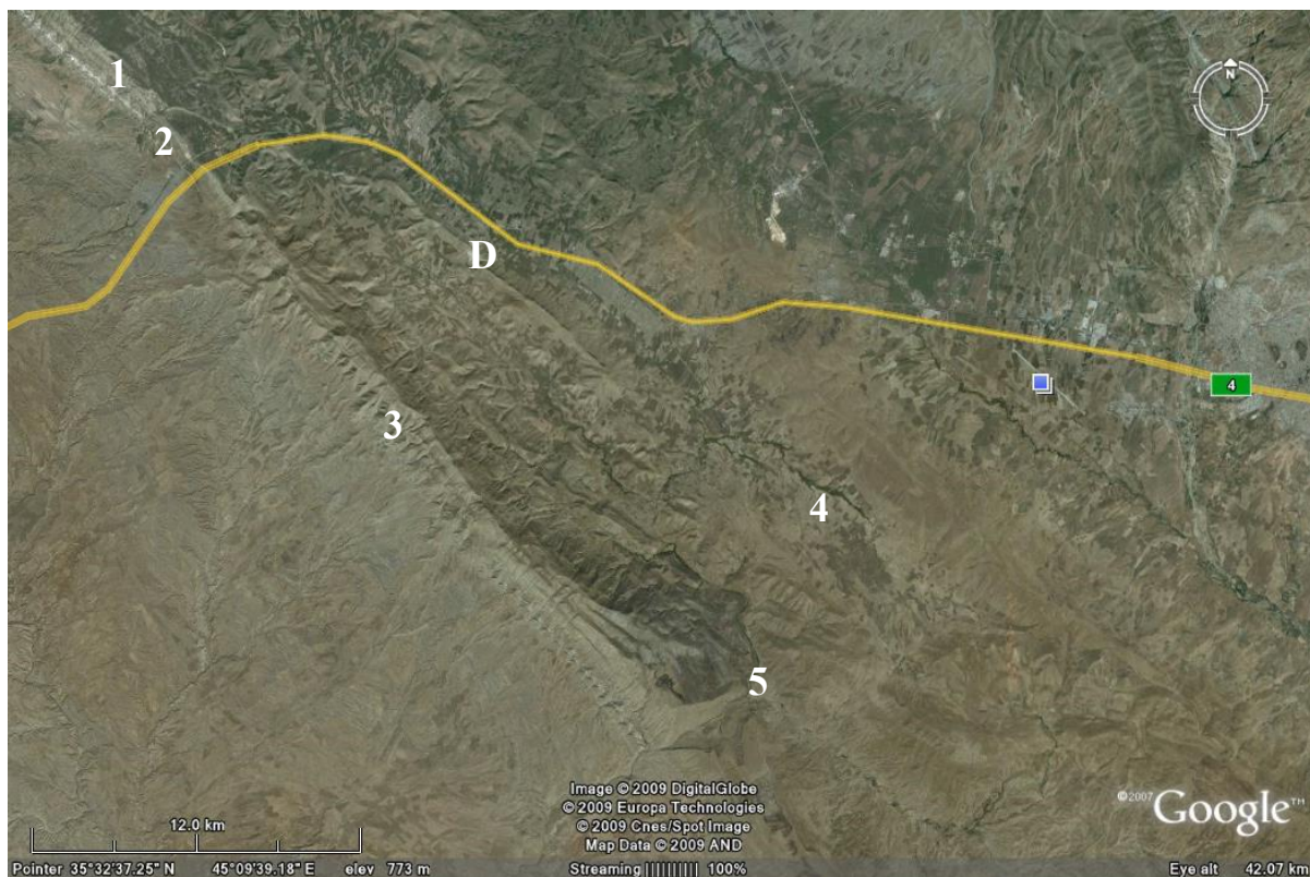
Fig.2: Google Earth image showing