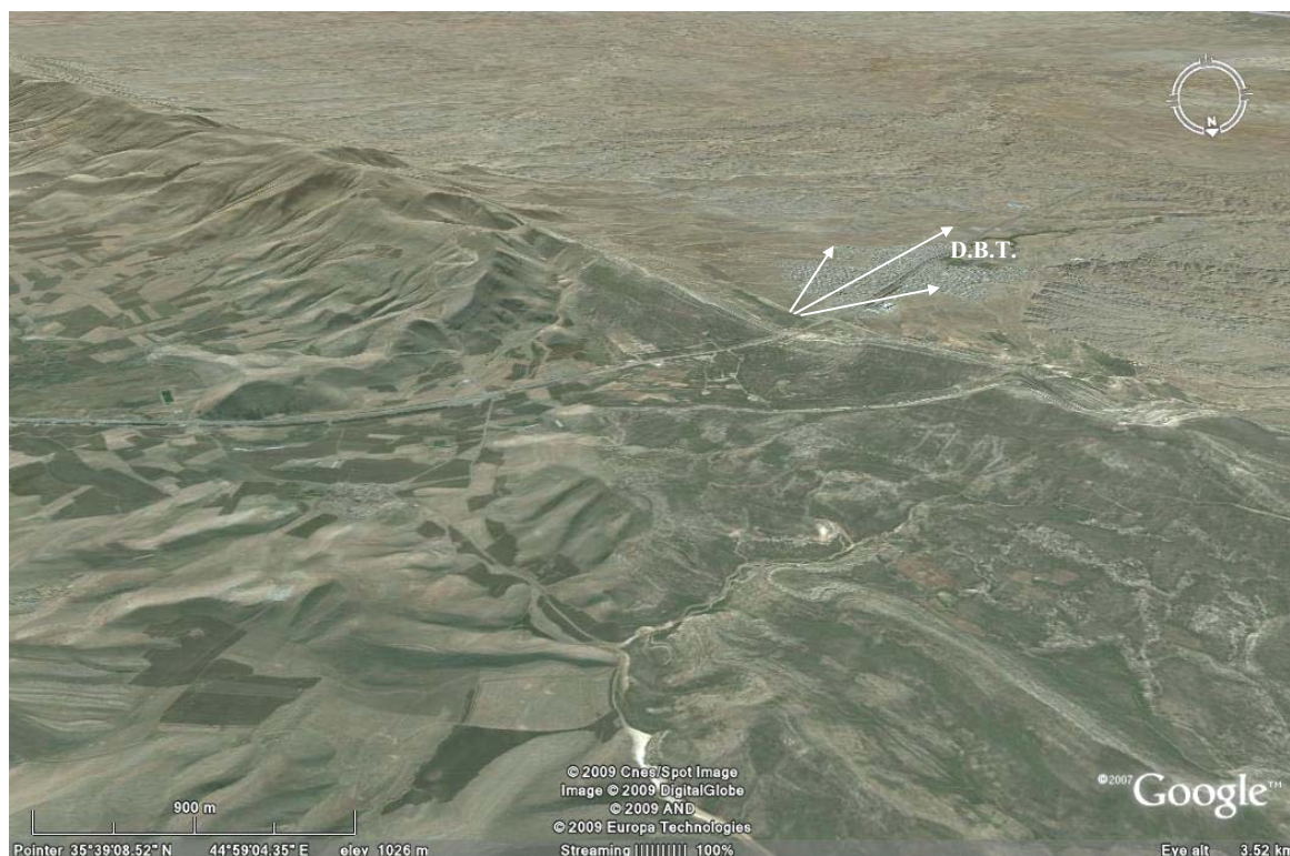
Fig.3: Google Earth image showing Darbandi Bazian Gorge with developed alluvial fans within Cham Chamal Plain.

The alluvial fan south of the Darbandi Bazian Gorge has coverage area of about 10 Km 2 , whereas the older one, near Cham Chamal town has coverage area of about 36 Km 2 (the remaining part only). The gradient of the concerned alluvial fan is 2.5% (1: 40), whereas the gradient along the northeastern side of the gorge is 1% (1: 100). The latter gradient is good indication for the absence of alluvial fan in the northeastern side of the gorge, because usually the slope of alluvial fans is about 10° (Bull, 1991).