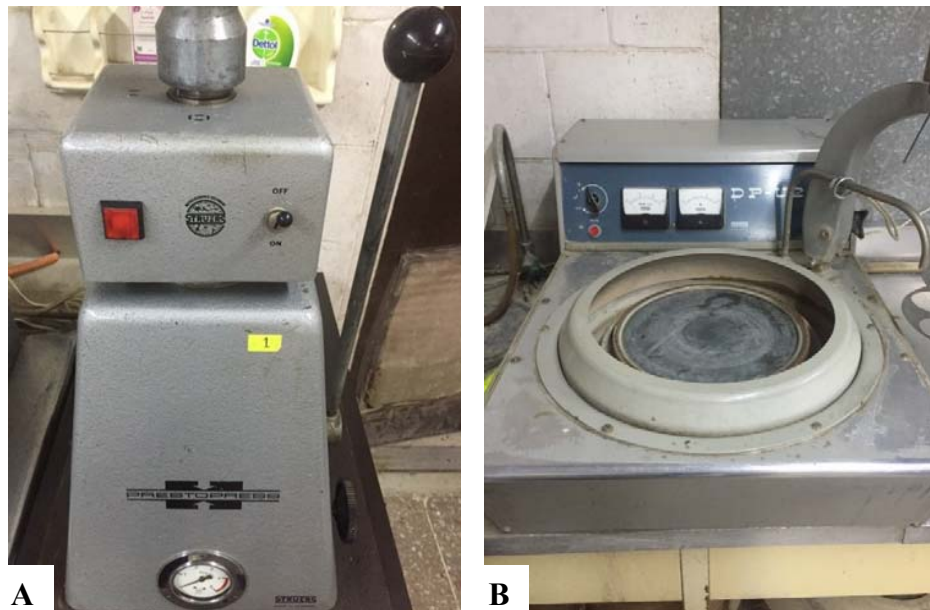
Fig.1: Presto-press device (A) used for making polished section; Dp-U2, a rotary grinding and polishing machine disc (B)

(R%) is measured at 546 nm in air performed by Laser Beam System composed of laser beam, photoelectric cell and galvanometer for measuring electric current. Laser beam invokes to receipt signals to a photoelectric cell that send to measure the electric current to be read on the microampere. The reflectance of the specimen is measured in the Optical Lab, Laser Branch, Applied Science Department, University of Technology. Polarized reflected light microscope is used to examine each stage of grinding, polishing and buffing, then a micro-image is picked up for each stage. This procedure is done in the Department of Geology, College of Science, University of Baghdad.