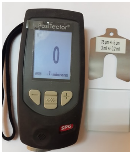
Fig.2: PosiTector device with standard plate and glass for the device normalization used for measuring the surface roughness